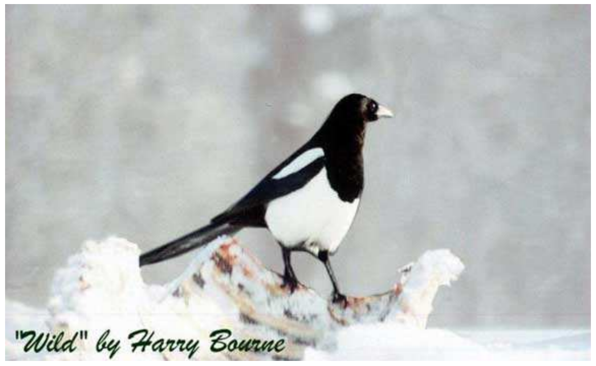
Tisdale - May 2, 2001 - by: Gerald Crawford

Parkland Photography Club had 100% attendance at its April 24th meeting - all 8 members turned out. Welcome back to Harry Bourne!