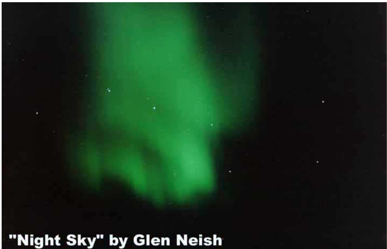
"Night Sky" by Glen Neish