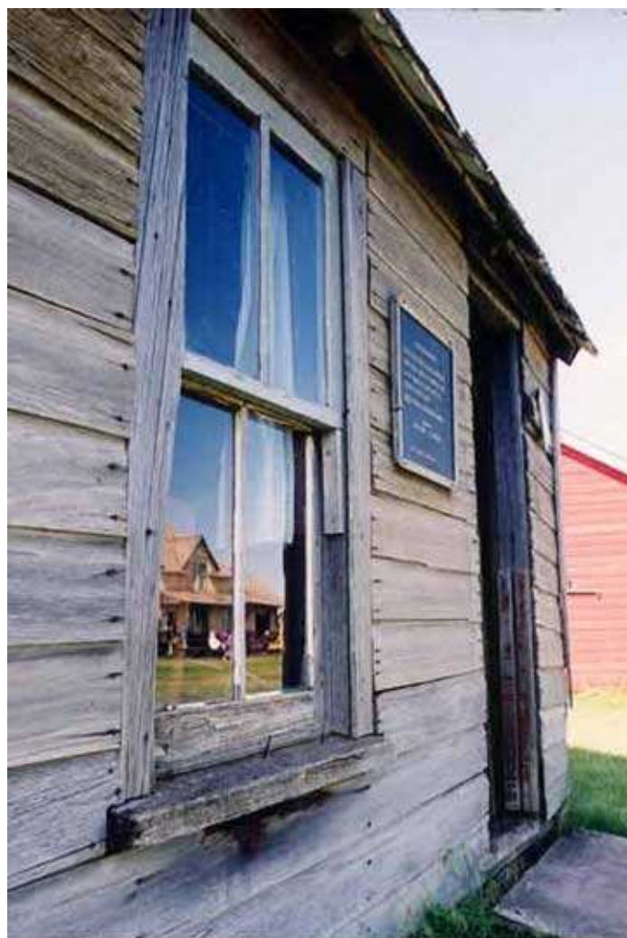
Wes Swan: Part of a Building

There were thirteen photos entered in our monthly " Theme Shoot ". Wes Swan won first with