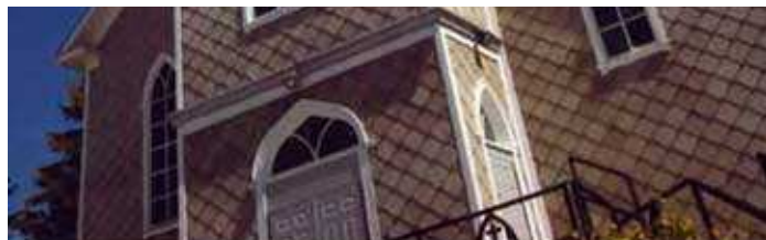
Jerry Crawford: Part of a Building

Return to Ensign - Return to Saskatchewan News