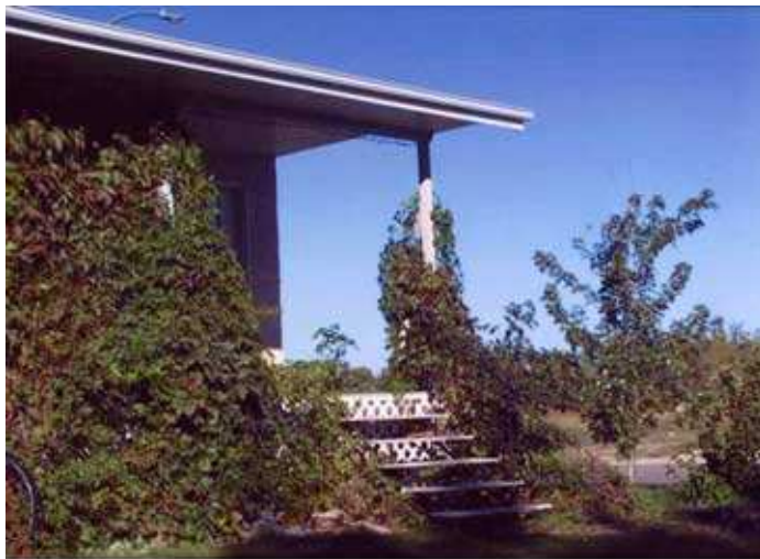
Dorothy Wark: Part of a Building