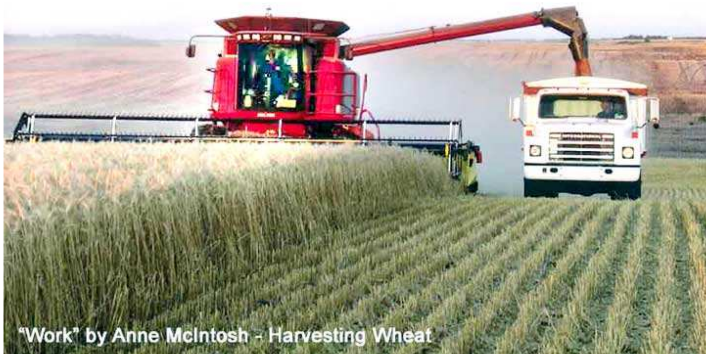
"Work" by Anne McIntosh - Harvesting Wheat