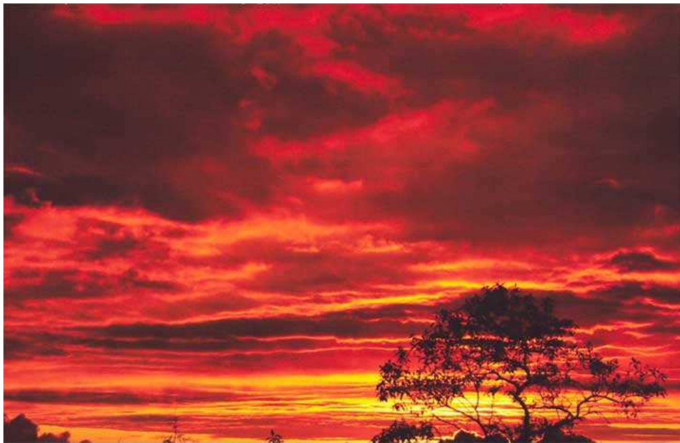
Tie for Second Place - "Costa Rican Sunset" by Anne McIntosh

Alan Caithcart presented two videos on Macro Photography (extreme close-up) using methods that did not require specialised equipment. This was accomplished by simply combining two lens. Various lighting techniques were illustrated using a telephoto lens with an extension tube, considering the depth of field, using a solid tripod and putting a bean bag on the lens to avoid shutter shake, and bouncing light back onto the subject using white or coloured reflectors.