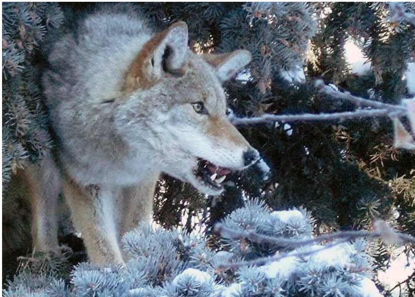
coyote in the spruce tree