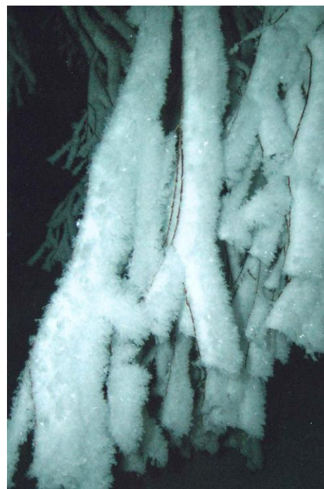
Second Place – Wendy Derbowka