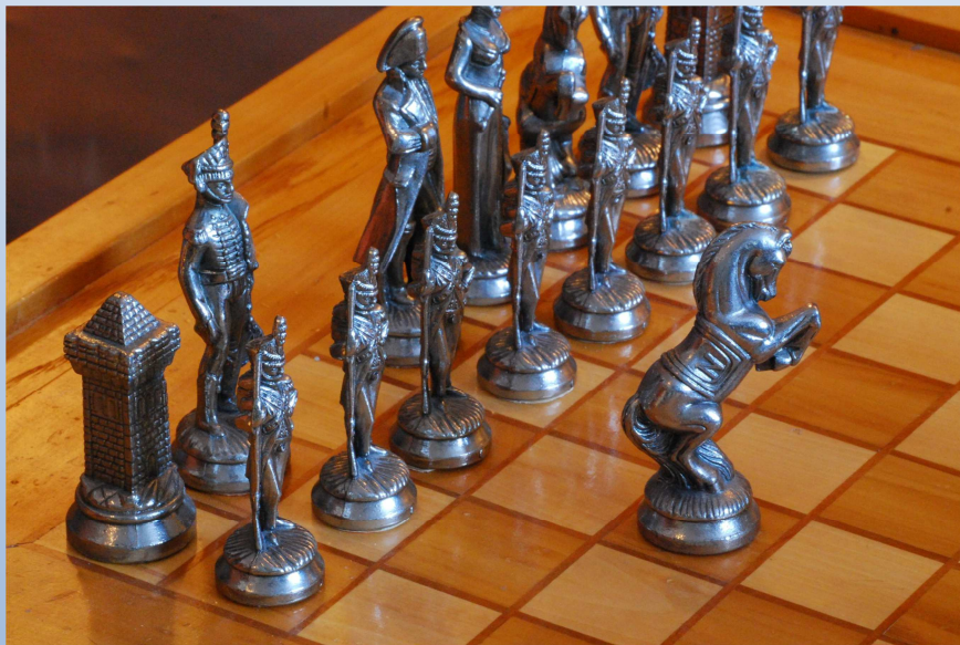
Second Place – BJ Madsen

Note: Webmaster Tim Shire is pleased with the images sent directly from computers rather than scanned images!