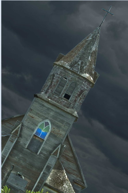
First Place – Gerry McLellan