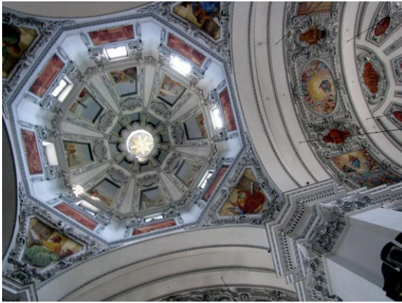
Church Ceiling in Salzburg, Austria