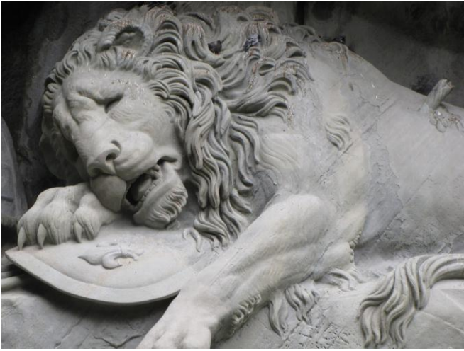
Agony – Monument to fallen soldiers in Lucerne, Switzerland