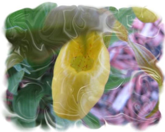
Lady Slipper 2010 – Melted Edges – Darlene McCullough, PPClub