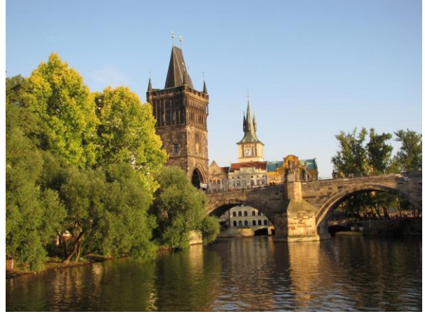
Charles Bridges in Prague – Darlene McCullough - PPClub