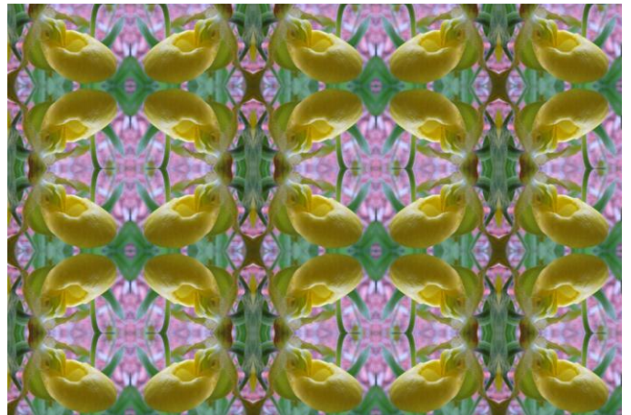
Lady Slipper 2010 – 3 – Kaleidoscope – Darlene McCullough, PPClub