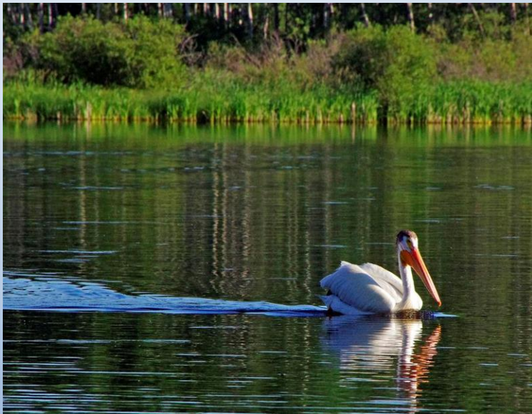
Second Place – Don Barbour