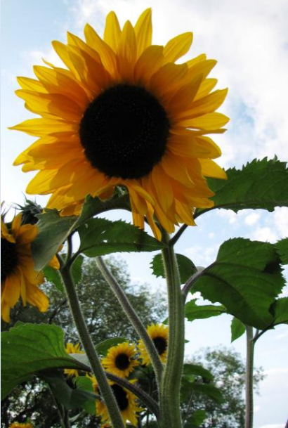
Back Lit Sunflower – Darlene McCullough