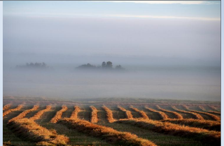
Crop and morning fog