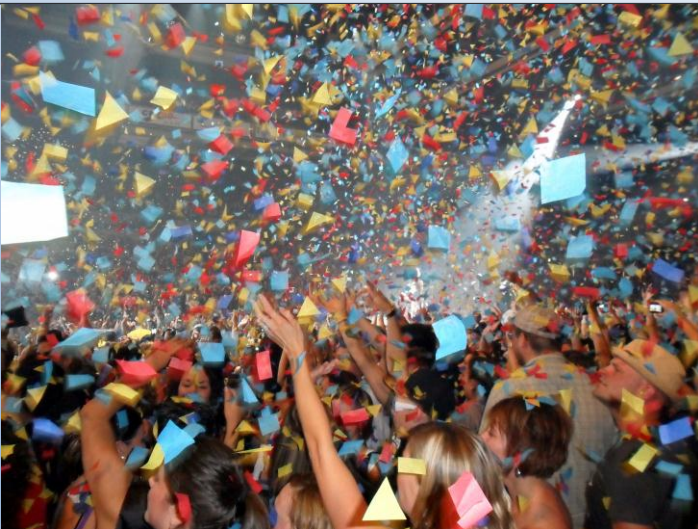
Fiesta – Salome van der Merwe