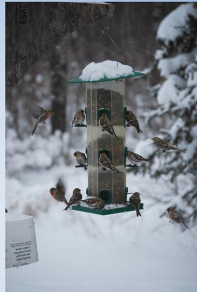
Heading South – BJ Madsen

Note: Webmaster Tim Shire is pleased with the images sent directly from computers rather than scanned images!