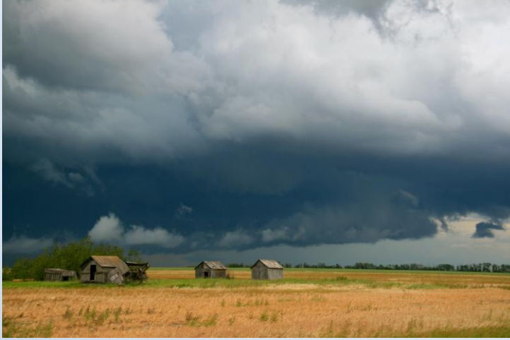
Another Summer Storm – Lia Boxall