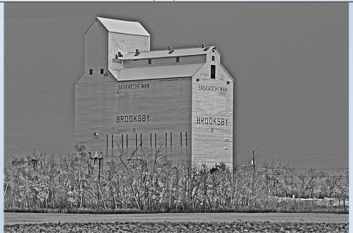
Third Place – Daylene Wallington

Note: Webmaster Tim Shire is pleased with the images sent directly from computers rather than scanned images!