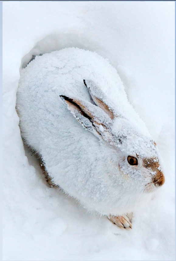
First Place (Tie) – Don Barbour