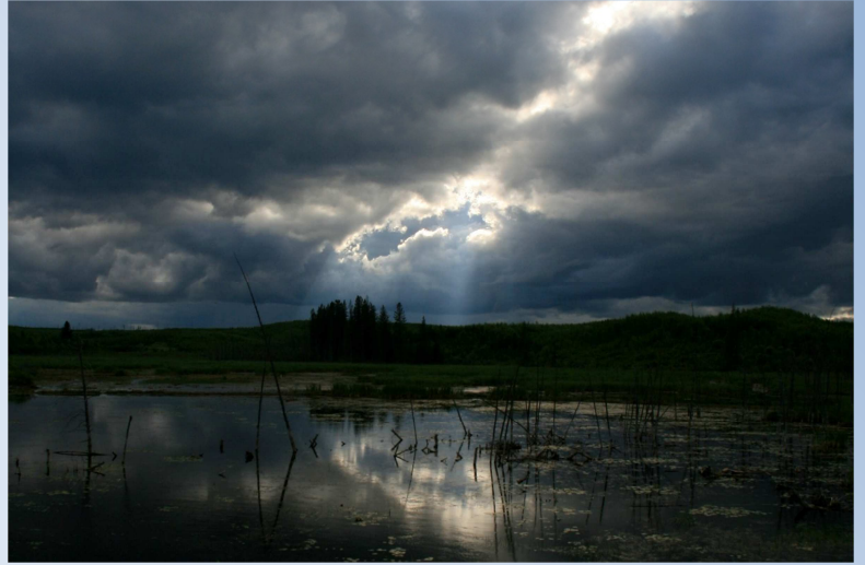
Second Place – Lia Boxall